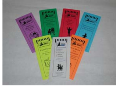
Nutrition BEST Brochures